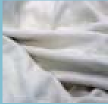
100% Bamboo Knitted Fleece